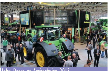
Deere at Agritechnica 2013 One of the larger tractor & machinery stands

A big advantage of attending Land. Technik-AgEng is the chance to visit the Agritechnica show, with a discounted pre-view ticket for Sunday and Monday and free entrance again on Tuesday.