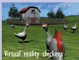
Virtual reality chickens