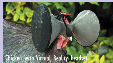
Chicken with Virtual Reality headset.