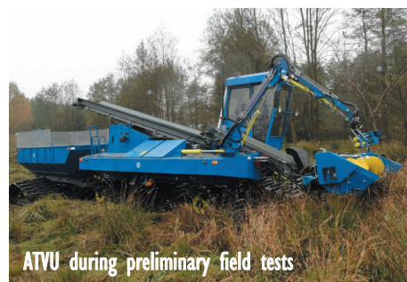
ATVU during preliminary field tests

The ATVU should have a minimal impact on the ecosystem with better environment protection thanks to biodegradable oils and lubricants, a diesel engine with Stage III emission standard, innovative tracks which have differential speeds during turns to reduce