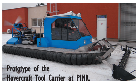
Prototype of the Hovercraft Tool Carrier at PIMR.

Trailers were not good enough to collect and transport the biomass efficiently but they could be used in the winter for harvesting biomass as fuel for power plants.