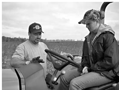
Instruction in tractor safety

The hypothesis for this project, based on the background information, was that the composite of a hydrostatic tractor will be more productive in acres processed and weight moved, expressed as statistical significance, versus a gear drive tractor. To test the hypothesis, field experiments were performed with hydrostatic and gear versions of the same model 32 horsepower tractor. One hour each of tilling, mowing, and load moving was performed with each tractor. Acreage measurements from the mowing and tilling operations were taken with a GPS. One thousand pound hay bales were used in the load moving operation. Production measurements were taken at the thirty-minute and one-hour intervals. T-tests were performed to analyze each data set.