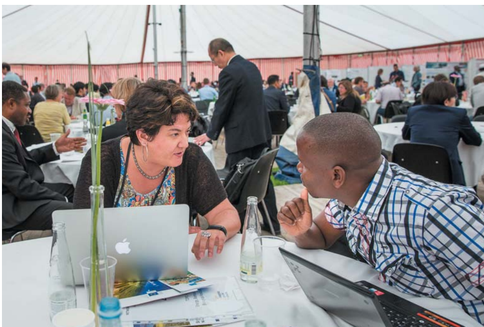
Networking in the Circus tent