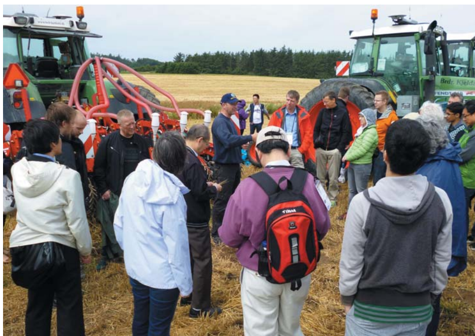
Technical field trip - Controlled Traffic Farming (CTF) on large scale vegetable production