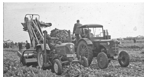
A picture from 1955 at Landtechnik / Technische Universität München archive

http://mediatum2.ub.tum.de/?cunfolde=11274&dir=11274&id=11274