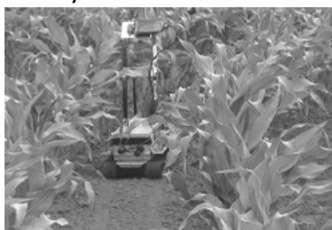
Field Robot navigating maize

As many as fourteen teams entered The Wageningen Field Robot Event which took place at Wageningen University at the same time as the Joint International Conference (JIAC) on 6-8 July 2009. Delegates from the conference made a special visit to the Robot Event to see the robots perform in the field. After anxious moments about the weather, the winners were Eyesonic 2009, Helios and EasyWheels. The Free